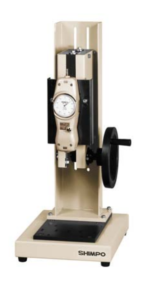
MF with FGS-100H Manually Operated Test Stand (sold separately)